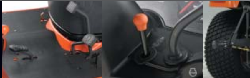
2-PEDAL HST OPERATION