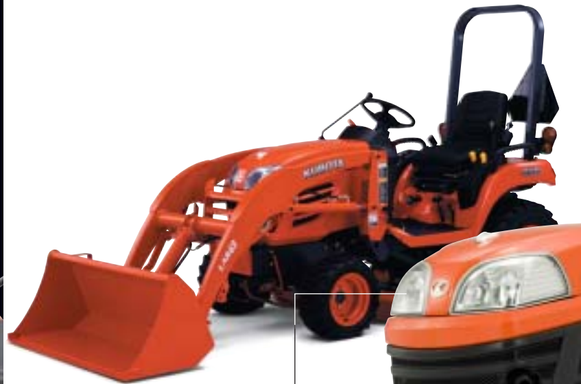
BRIGHT HALOGEN HEADLIGHTS