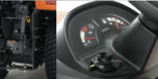
CATEGORY I DIGITAL TACHOMETER