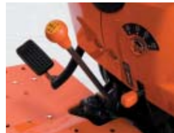
Partially synchronised main gear shift

Kubota's new Synchro Shuttle Transmission lets you spring into action with smooth operability and powerful agility. The MX5100's hanging clutch and brake pedals deliver easy manoeuvrability when shifting. And, with 4 main shift speeds and 2 range-shift speeds (Hi/Lo), you have 8 forward and 8 reverse speeds to choose from, giving you the versatility you need to maximise your productivity.